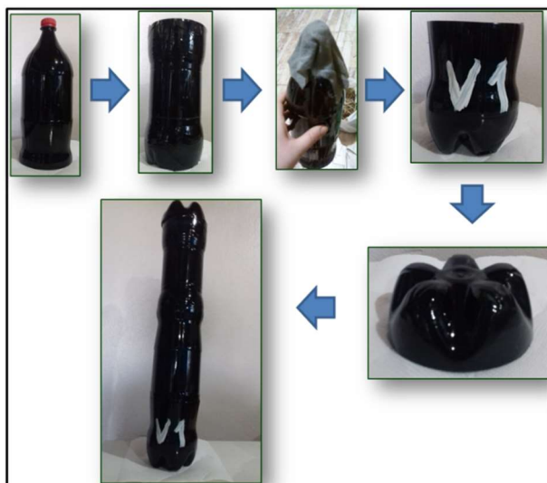
Fig.1: Production of vessels composting and vermicomposting.

The vessels were made with three plastic bottles with a capacity of 2 L, fitted so that the container had a slurry collector, a space for the compound that was in the process of formation and another space for the insertion of fresh residue. The total capacity was 4 L, the bottles were colored black so that there was no light interference in the process, shown in Figure 1.