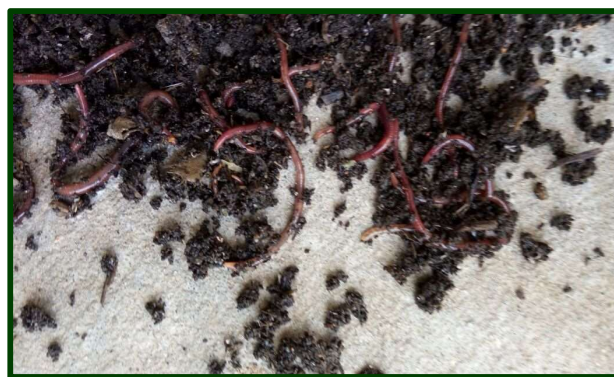
Fig.2: Eusemia andreii earthworms.

Domestic solid waste used falls within Class II A non-hazardous and non-inert 0, such as fruit peels, yerba mate, and leftover vegetables. The residues were cut in 3-5 cm so that the granulometry did not interfere in the result and were added weekly in the plots. In the first week 500g of domestic organic waste with 100g of grass straw was placed. In the other weeks only 500 g of various household waste were introduced. The vermicompost was composed of 5 Eusemia andreii earthworms in each plot 0, with a mean of 3 cm ( \pm 0.5 cm) in length. After three weeks, an evaluation was made and the number of dead earthworms was restored so that all the plots were left with 5 earthworms, shown in Figure 2.