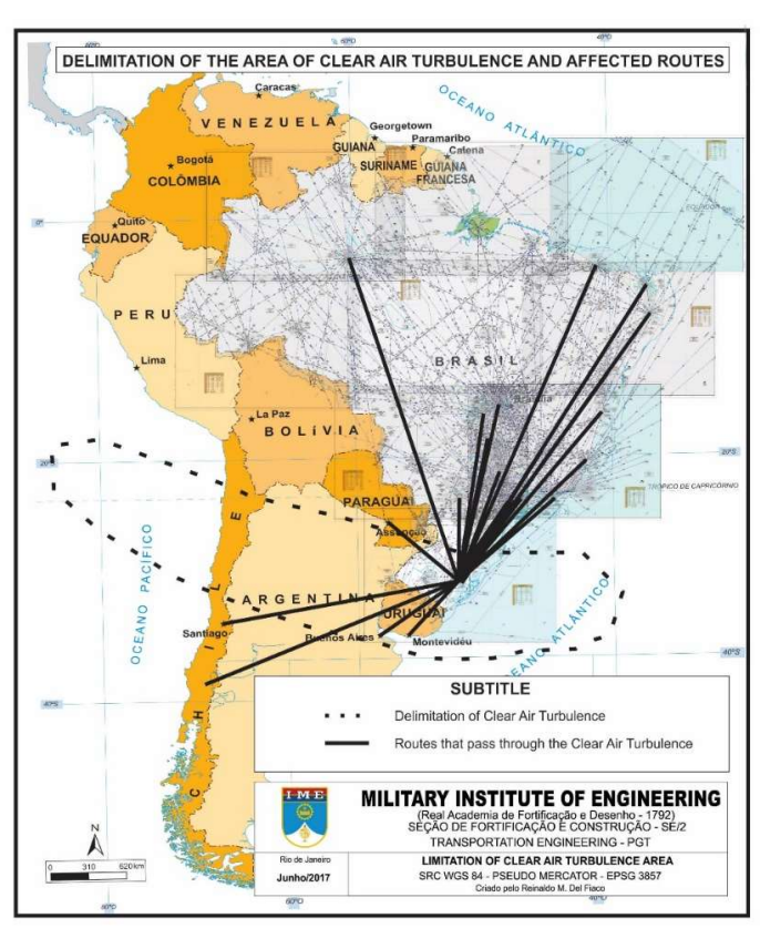
Figure 3: Delimitation of the area of occurrence of Clear Air Turbulence and affected routes.

The affected routes are from the following airports: Aruba (TNCA); Asunción (SGAS); Belo Horizonte – Confins (SBCF); Belo Horizonte – Pampulha (SBBH); Curitiba (SBCY); Bogota (SKBO); Brasília (SBBR); Buenos Aires (SAEZ); Cabo Frio (SBCB); Caldas Novas (SBCN); Campinas (SBKP); Campo Grande (SBCG); Cuiabá (SBCY); Curitiba (SBCT); Goiânia (SBGO); Londrina (SBLO); Maceió (SBMO); Manaus (SBEG); Maringá (SBMG); Montevideo (SUMU); Porto Seguro (SBPS); Recife (SBRF); Rio de Janeiro – Galeão (SBGL); Rio de Janeiro – Santos Dumont (SBRJ); Salvador (SBSV); Santiago do Chile (SCEL); São Paulo – Congonhas (SBSP); São Paulo – Guarulhos (SBGR); Temuco (SCTC); and Vitória (SBVT).